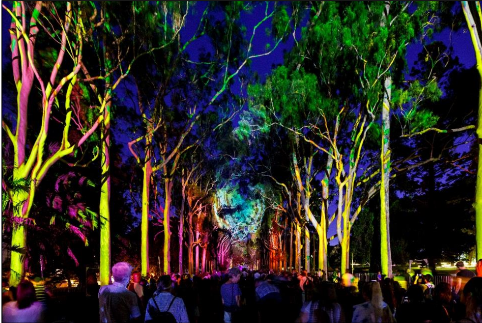
Figure 2.1: 'Boorna Waanginy: The Trees Speak' at Kings Park