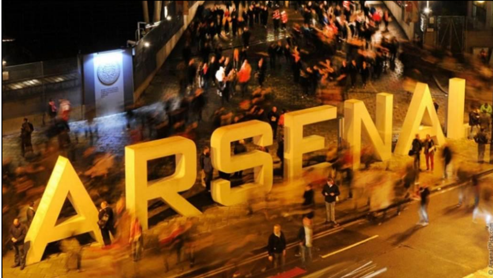
Figure 2.2: Sculpture as vehicle security barriers